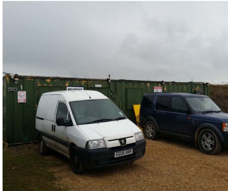
Photograph 5. Site welfare area, staff and visitor lighting