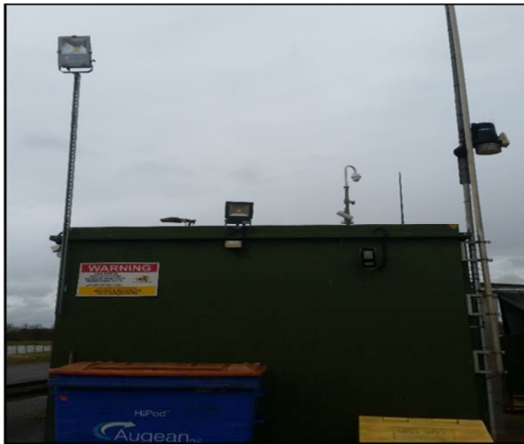
Photograph 2. Weighbridge pedestrian walkway safety lighting