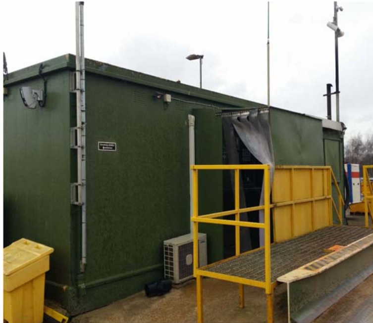
Photograph 3. Weighbridge. Drivers' entrance lighting