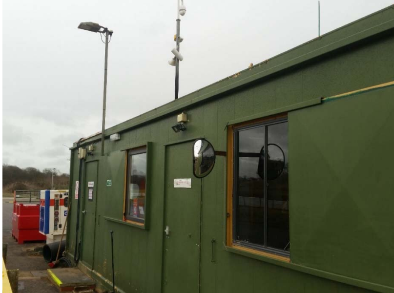
Photograph 1. Weighbridge / Site office entrance lighting