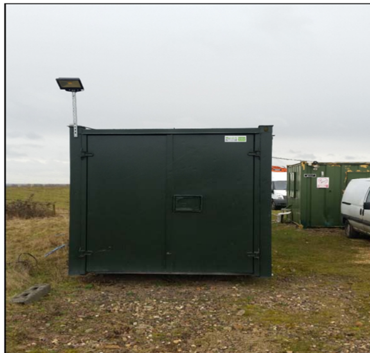
Photograph 4. Route to welfare facilities. Pedestrian walkway safety lighting